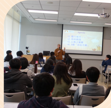
Students learned how to resist daily pressure from the perspective of Buddhism.