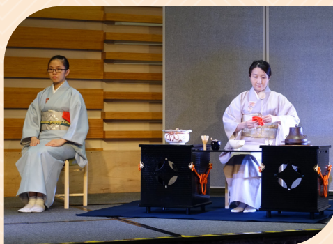
Students were fascinated by the demonstration of Japanese Tea Ceremony.