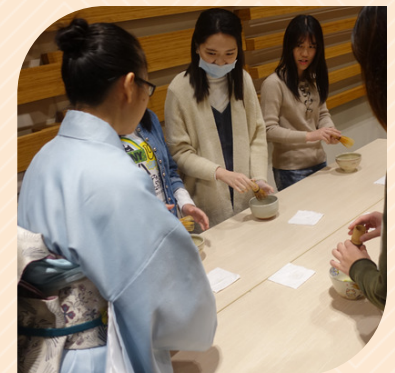
Students made Japanese tea by themselves.