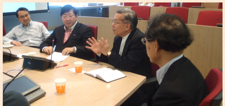
Faculty attended the seminar and discussed the rationale of General Education of HSMC.