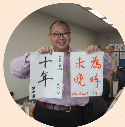
Assistant Professor Department of Social Science