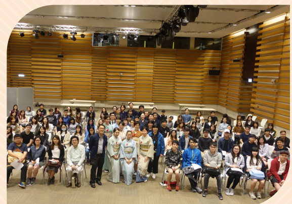
Group photo of all demonstrators and participants